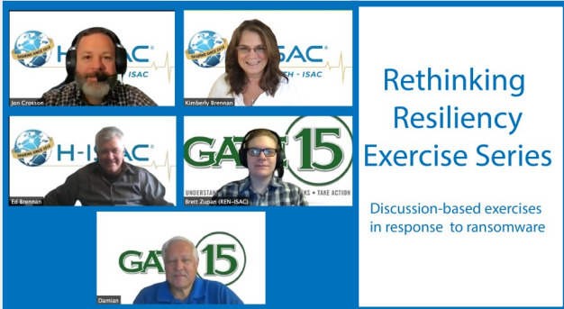
Pictured above are the exercise delivery team members.

On June 22, the first group of H-ISAC members worked through each step of their collaborative response to a ransomware attack scenario.